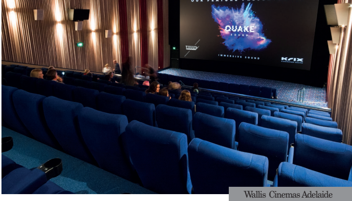
Wallis Cinemas Adelaide

The Ovation and Ovation 2 have been called on in other specialty configurations as well, including DTS-X 15.1 and the Samsung Onyx LED cinema, where time, phase, frequency and impulse response become very important factors in the clarity, impact and immersion.