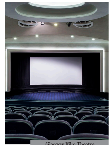
Glasgow Film Theatre